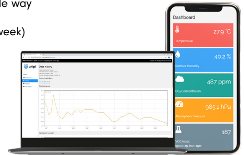
Web interface preview